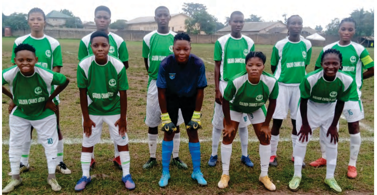
FC Robo Queens

"We will do everything possible to get to the final of the Aiteo Cup this year and win it because that's our target."