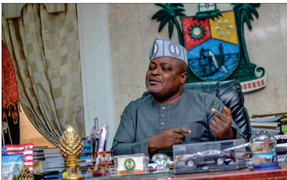
Rt. Hon. Mudashiru Obasa

the outcome of the election but that is democracy for us.