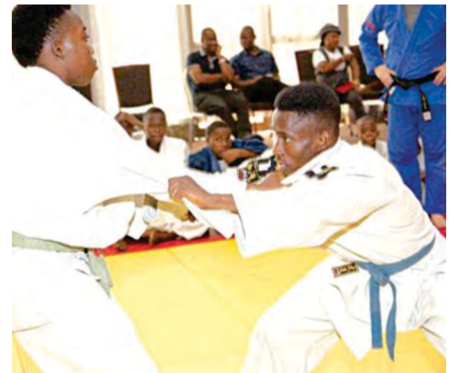
Judo athletes engage in a contest

"I am proud of the athletes, their conditioning, training and other