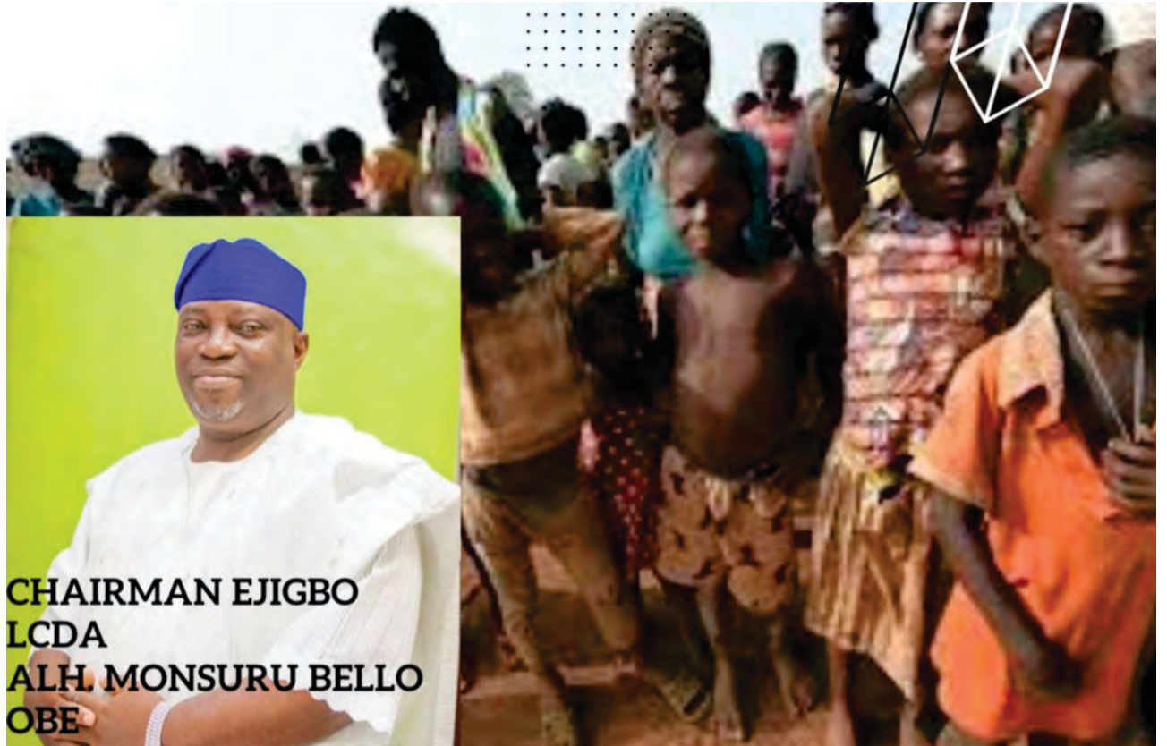
African Refugees (inset: Hon Monsurudeen Bello Obe)

makes it a priority for the council to be of help. Obe made the call following the June 20th World Refugee Day celebration across the nation. He appreciated that as refugees, their coordination and strength in assembling themselves after fleeing from the conflict and persecution of their country / state in hope of finding sanctuary and living a better Life. He decries the segregation in Ukraine war front as blacks (Africans) is given the least priority (3rd class) to get a boarding pass for their safety. He maintained that safety is everyone's responsibility regardless of colour or race.