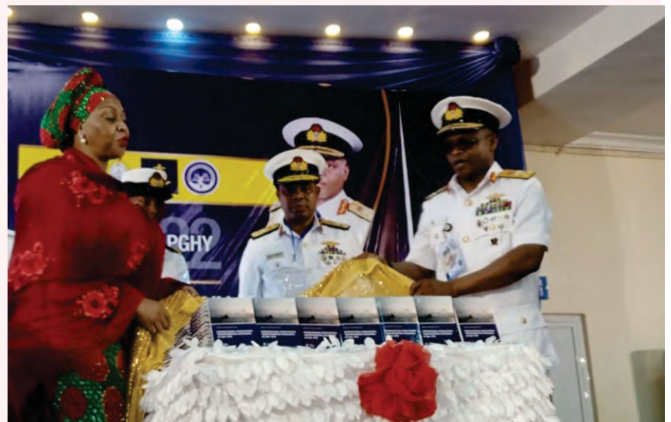
Senator Gbemisola Saraki with the Chief of Naval Staff, Vice Admiral Awwal Zubairu Gambo and another Navy officer

"I consider the theme for 2022 World Hydrographic Day; which is "Hydrography: Contributing to the United Nations Ocean Decade" quite apt. This is due to the